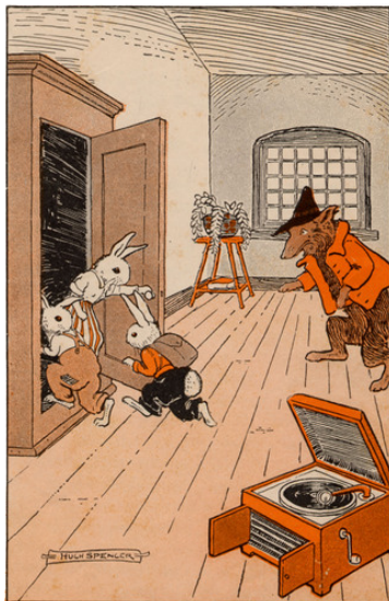
THE RABBITS JUMPED INTO THE CUPBOARD AND CLOSED THE DOOR.

“I’ve brought my friend, Billy Bunny, home to lunch,” said the old gray-haired bunny to a nice-looking lady rabbit whose gray hair was parted in the middle and held down on each side by two red coral combs.