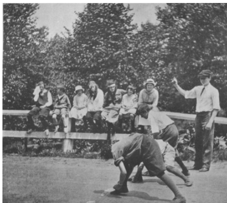
A RACE, WHILE “WAKO” SAT ON THE FENCE.

“I wasn’t quite sure of what I was supposed to do, so I collected a few short notes—but I can do better next time, Miss—O Chief!” explained Mildred.