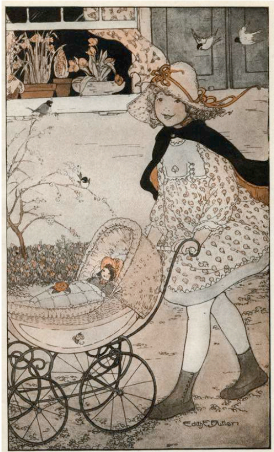
“IT’S SPRING, LUCY LOCKET,” CHATTERED LYDIA. “THAT’S WHY YOU HAVE A NEW HAT AND A NEW DRESS”