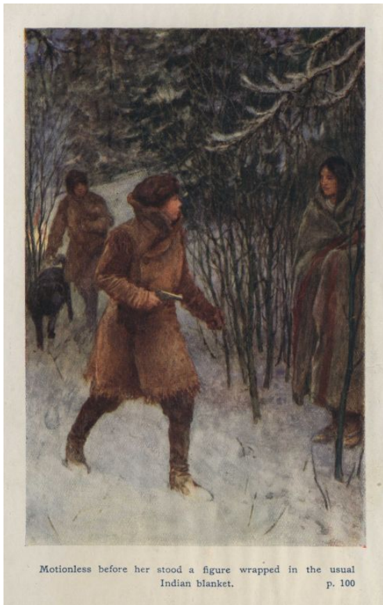
Motionless before her stood a figure wrapped in the usual Indian blanket. p. 100