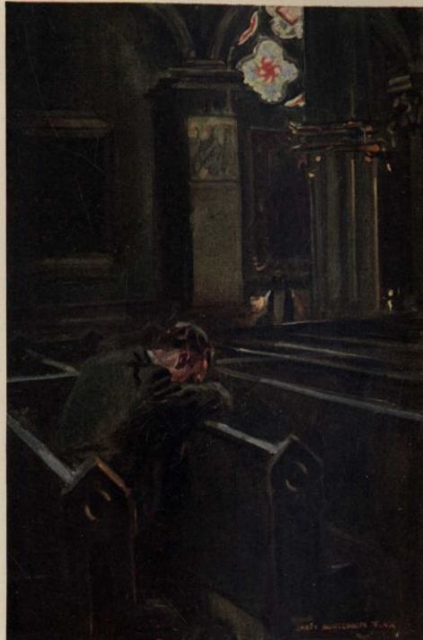
An acolyte, entering in the gray of the early morning, saw on the last of the kneeling benches a man resting with bowed head