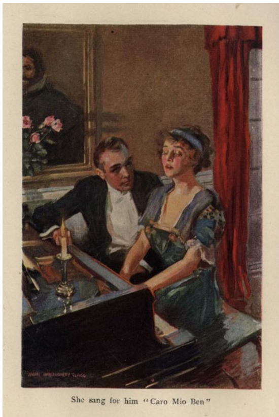
She sang for him "Caro Mio Ben"