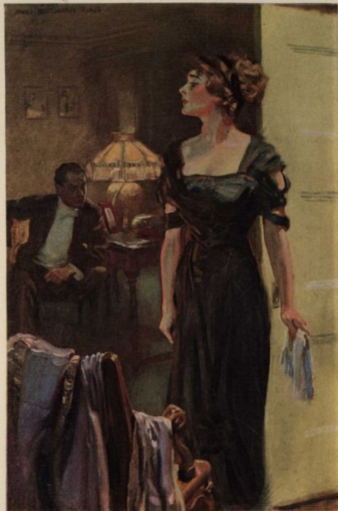
"I despise your threats," she said, choking with her own words. "I despise you."

"I despise your threats," she said choking with her own words. "I despise you."