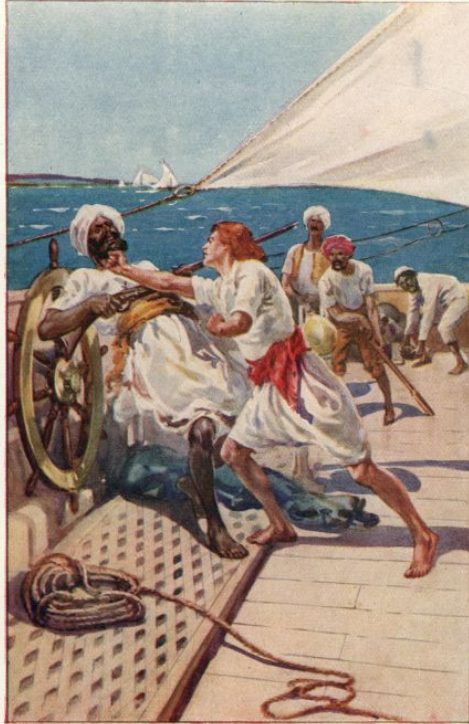
A SHORT WAY WITH MUTINEERS.

muskets, and tearing one from its fastenings raised it to his shoulder. Desmond seized the moment with a quickness that spoke volumes for his will's absolute mastery of his body. As the man pulled the harmless trigger, Desmond leapt at him; a crashing blow beneath the chin sent him staggering against the wheel; a second while he tottered brought him limp and almost stunned to the deck.