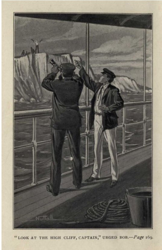
"LOOK AT THE HIGH CLIFF, CAPTAIN," URGED BOB.—Page 169.