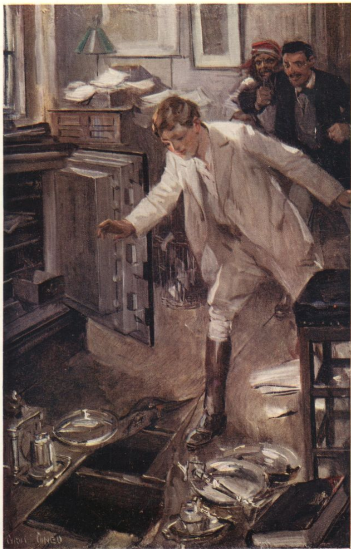
THE HOLE IN THE FLOOR