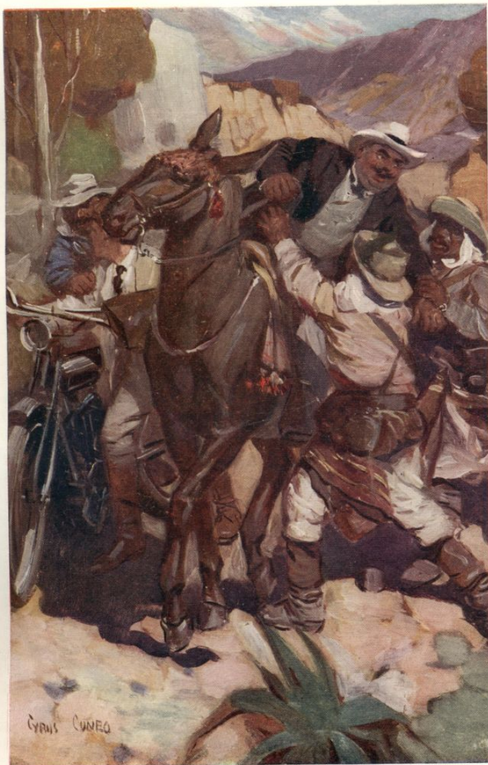
CAPTURED BY BRIGANDS