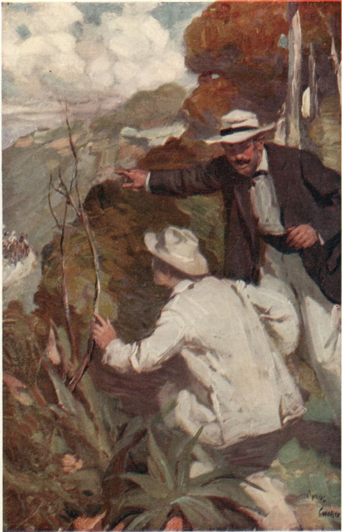
HORSEMEN ON THE TRACK