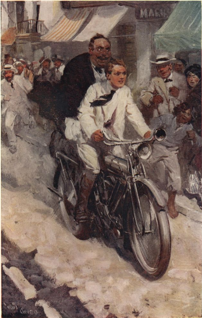
THE GOBERNADOR RIDES