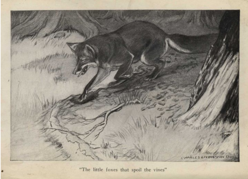
"The little foxes that spoil the vines"