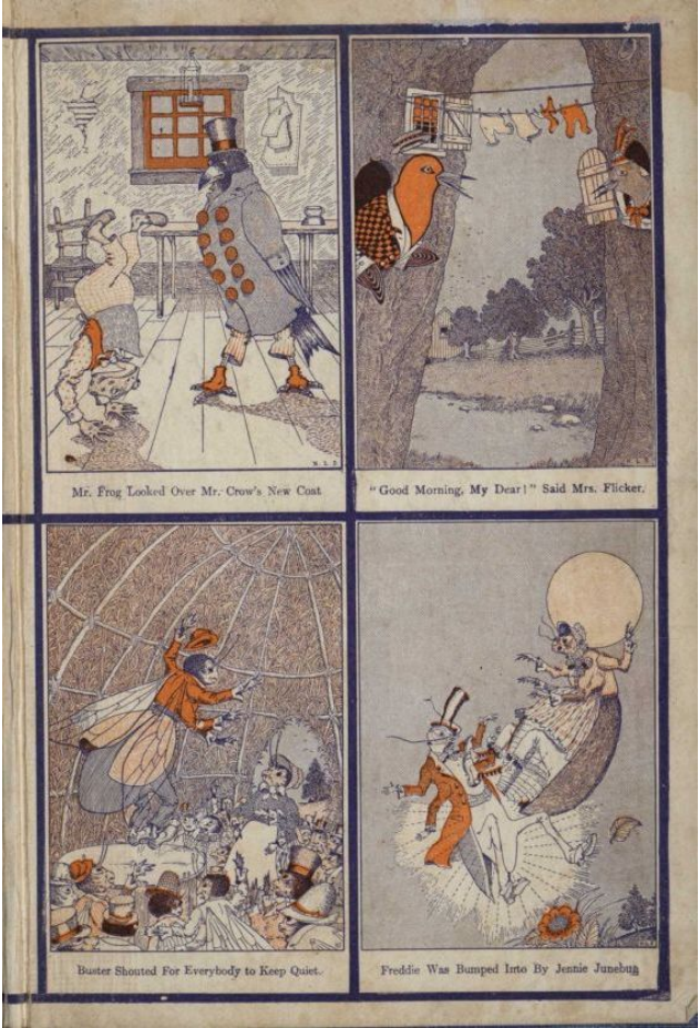
Mr. Frog Looked Over Mr. Crow's New Coat.