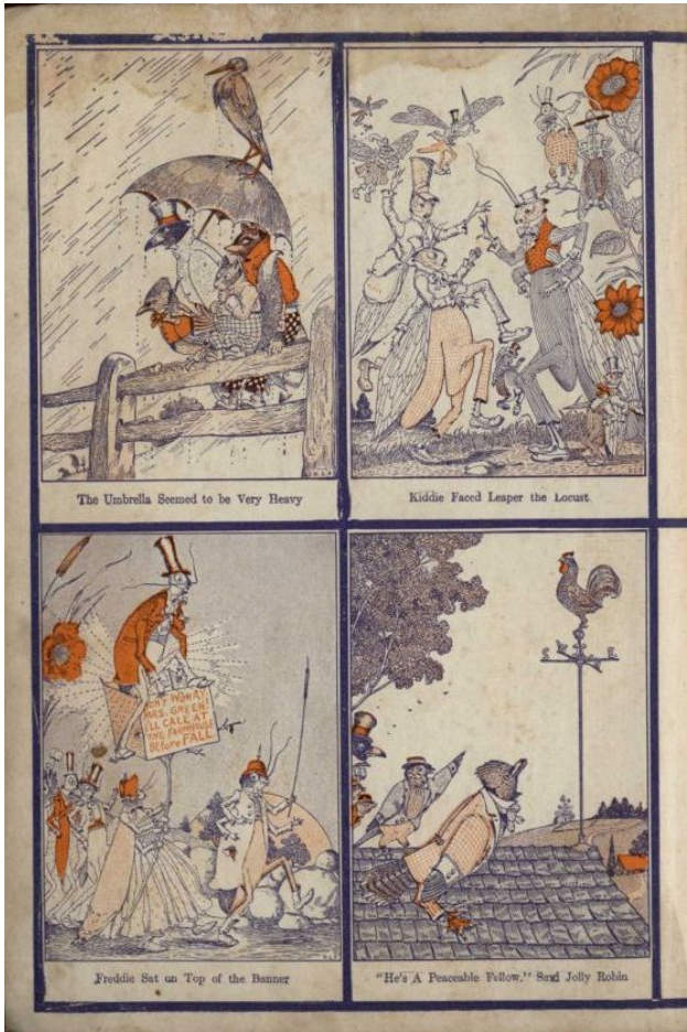
Rear end paper - left half