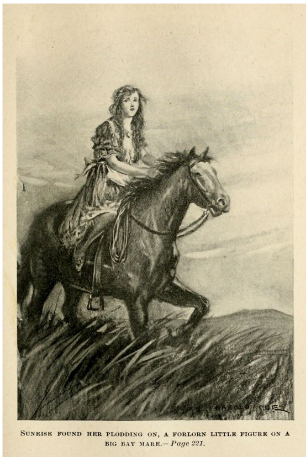
SUNRISE FOUND HER PLODDING ON, A FORLORN LITTLE FIGURE ON A BIG BAY MARE.— Page 221.

Sunrise found her plodding on, a forlorn little figure on a big bay mare, tears running down her face, and muffled sobs shaking her.