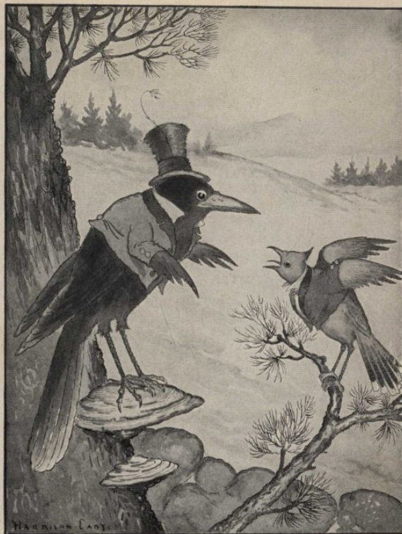
Sammy flew straight over to where Blacky was sitting. Page 102.

Sammy flew straight over to where Blacky was sitting.