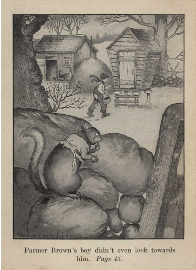
Farmer Brown's boy didn't even look towards him. Page 45.

in all his life, more corn than he had supposed the whole world held! Chatterer made up his mind right then and there that he was going to have some of that corn in spite of Black Pussy and Bowser the Hound and Farmer Brown's boy. The very sight of it screwed his courage up till he felt brave enough to dare anything.