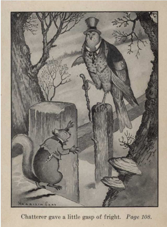
Chatterer gave a little gasp of fright.