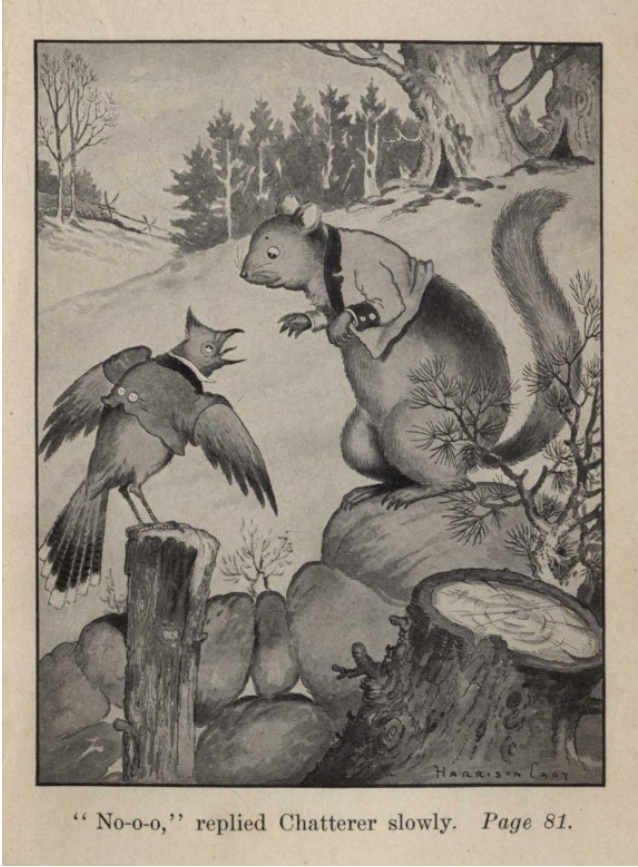
”No-o-o,” replied Chatterer slowly.