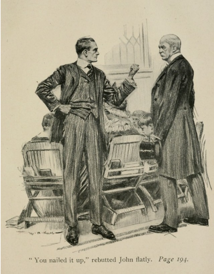
"You nailed it up," rebutted John flatly. Page 194.

"You nailed it up," rebutted John flatly.