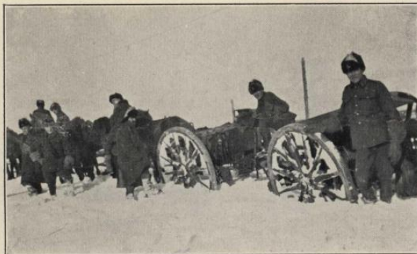
The Canadian artillery got there every time.