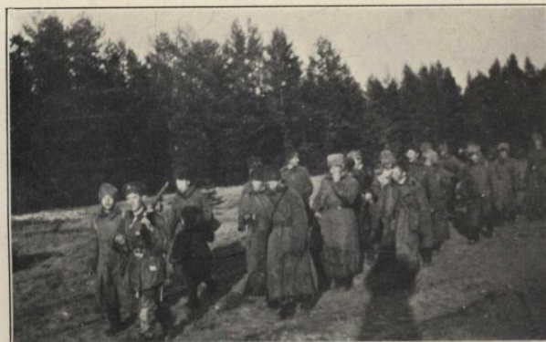
Bringing Bolsheviki prisoners into Malobereznik.

Canadian soldiers with two captives, having changed caps. Bringing Bolsheviki prisoners into Malobereznik.