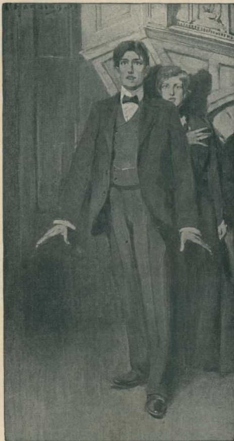
"It's a storm!" he cried. (See page 90.)