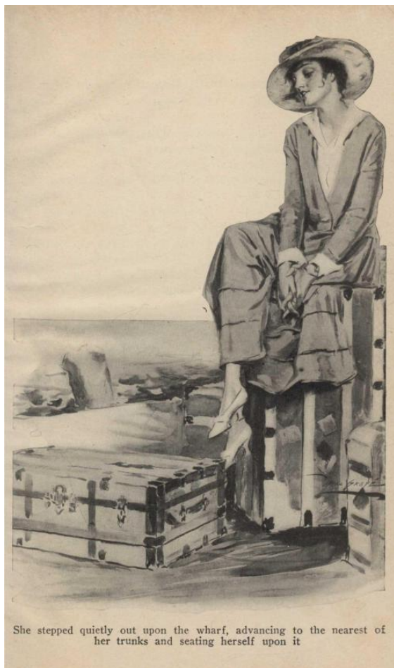
She stepped quietly out upon the wharf, advancing to the nearest of her trunks and seating herself upon it