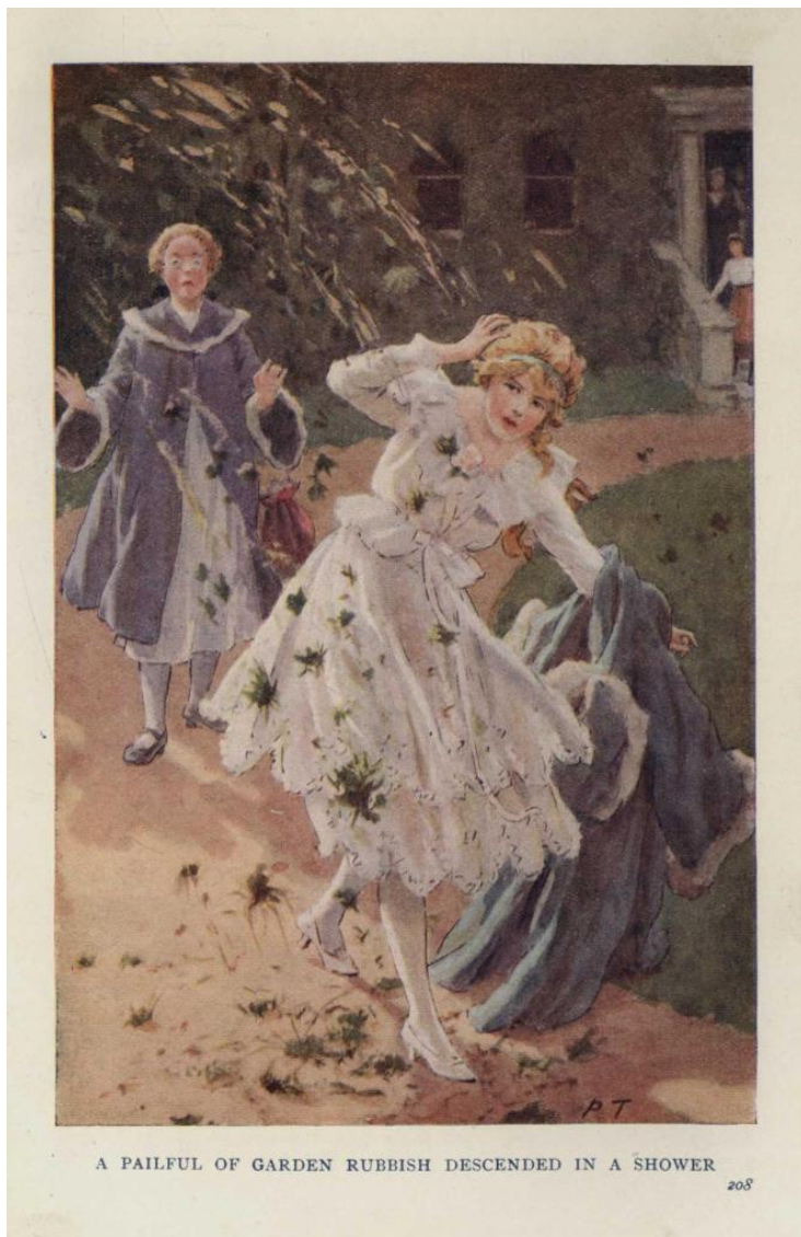
A PAILFUL OF GARDEN RUBBISH DESCENDED IN A SHOWER