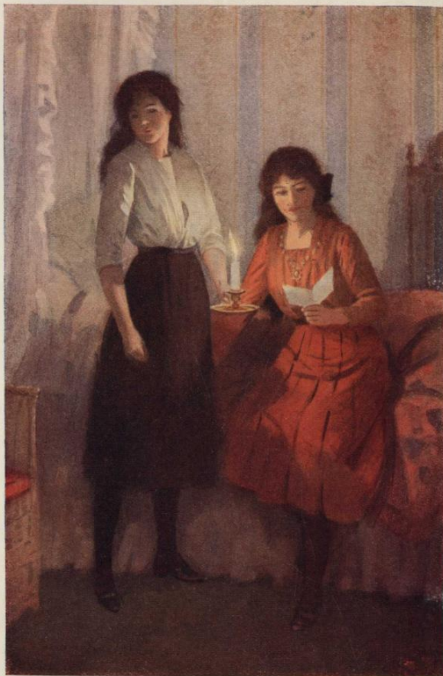
PAMELA READ THE SIGNATURE OF BERYL'S MOTHER THROUGH A BLUR OF TEARS