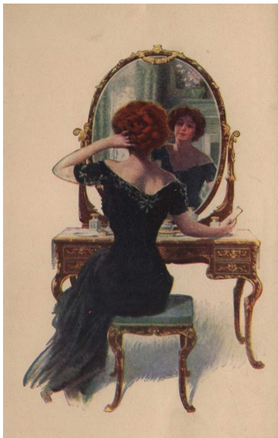
As she sat before her mirror...