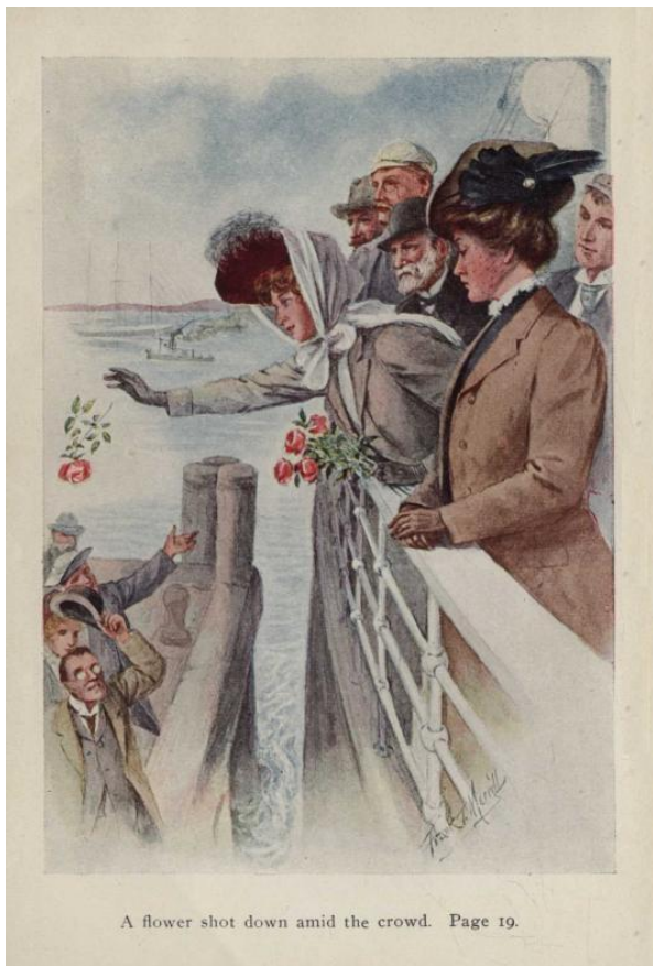
A flower shot down amid the crowd. Page 19.