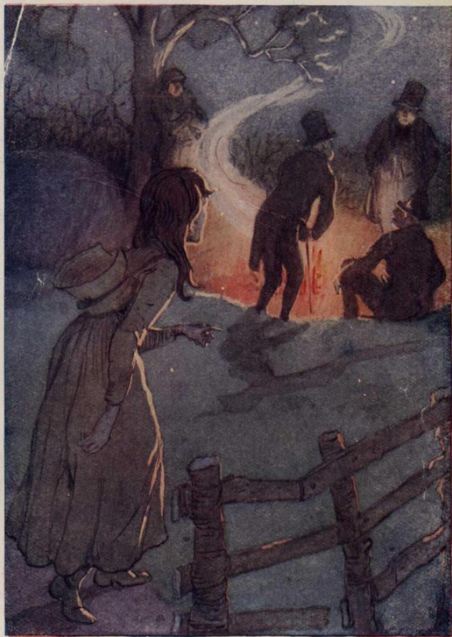
After a few moments she moved nearer to the group (page 108)

After a few moments she moved nearer to the group