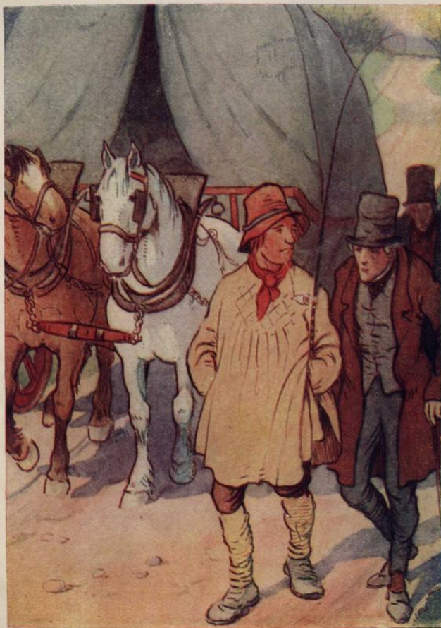
When the wagon came Nell was placed inside (page 138)