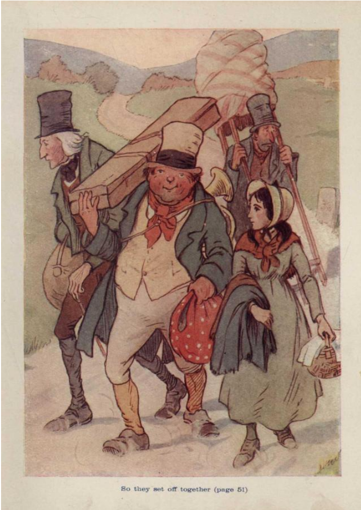
So they set off together (page 51)