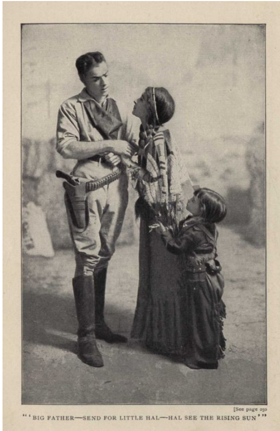
“BIG FATHER—SEND FOR LITTLE HAL—HAL SEE THE RISING SUN” See page 250