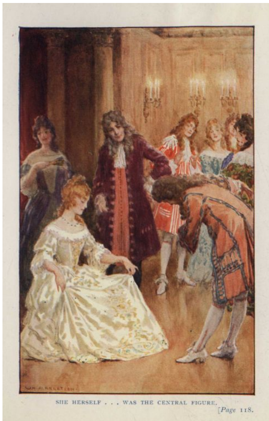
SHE HERSELF . . . WAS THE CENTRAL FIGURE. [Page 118.

SHE HERSELF ... WAS THE CENTRAL FIGURE. Page 118.