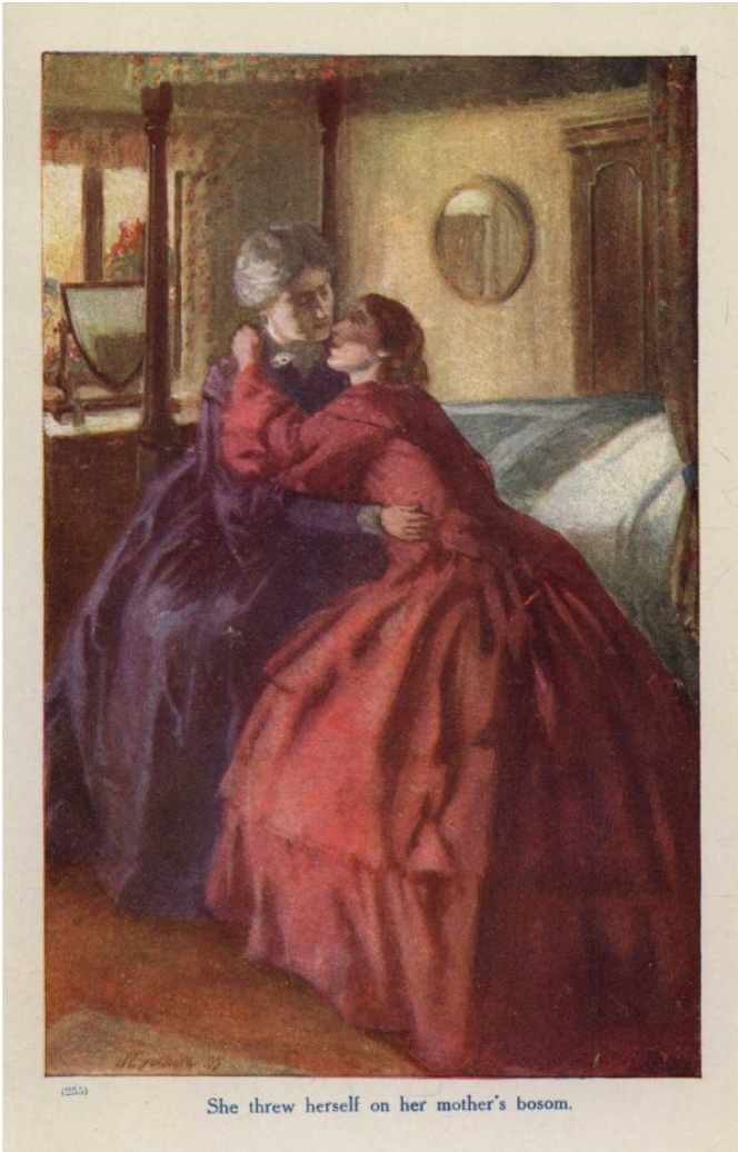
She threw herself on her mother's bosom.