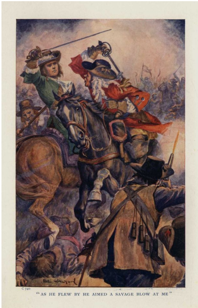
"AS HE FLEW BY HE AIMED A SAVAGE BLOW AT ME" (Page 217)